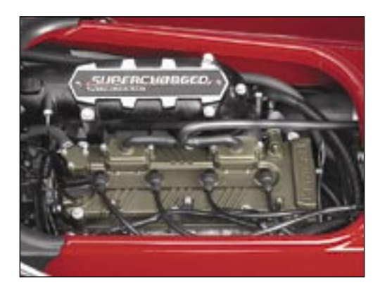
The Ogura Supercharger is custom built into the Kawasaki engine

By feeding the Kawasaki engine 2 liters of air with every